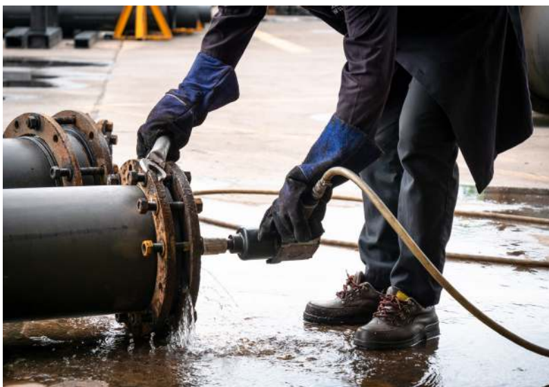
Figure 1. Performing a pipeline hydro test.

A patent was awarded not long ago to a design that protects the GRE from the media by utilising a PTFE barrier. The barrier is more than just a barrier, it is also the primary sealing element for the isolating gasket. The PTFE seal is interlocked into the GRE/316 stainless steel core and during installation conforms to the flange surface, creating a very tight seal. This not only keeps the media from entering the GRE, but also provides the isolation gasket with other benefits, such as better resistance to sour gas media and other aggressive mediums (GRE materials are not