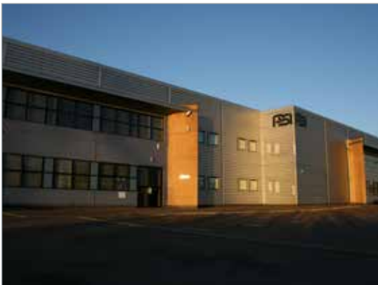
GPT St. Neots, UK