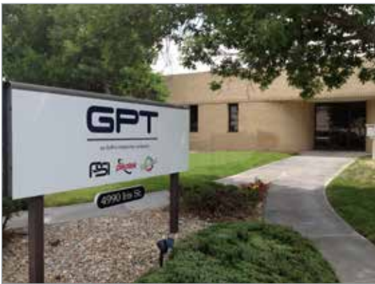
GPT Wheat Ridge, Colorado