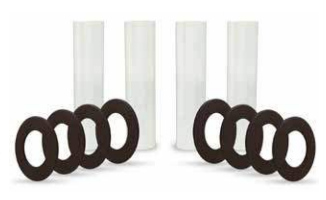
To specify EVOLUTION® please find specification at www. aptindustries.com