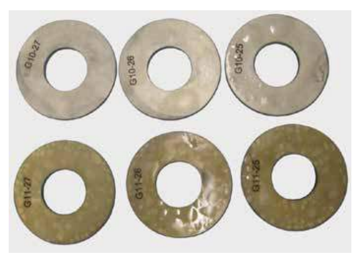
Chemical (H<sub>2</sub>S) attack on GRE isolation gasket