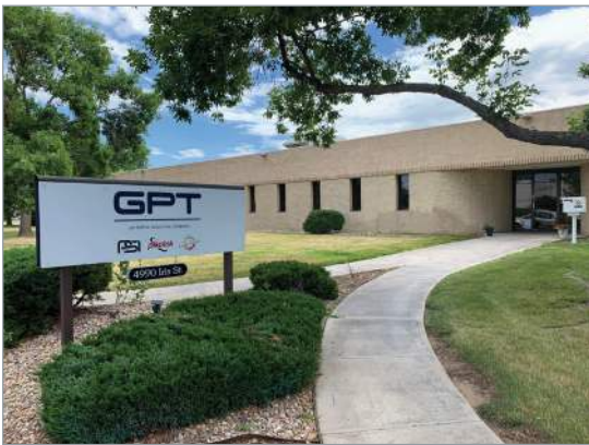
GPT Wheat Ridge, Colorado

LineBacker® isolation kits are manufactured in Wheat Ridge, CO. Our facility utilizes the industry's most technologically advanced manufacturing equipment and finest glass reinforced epoxy laminates along with premium elastomers to become the industry's leader in isolating kits. GPT prides itself on highly innovative, engineered products that can only be developed from the best raw materials. GPT produces innovative solutions that enhance the integrity of pipeline systems today to meet the demands of tomorrow. GPT also offers our application engineering services to optimize product selection, advise and train installation best practices, supervise installations and design isolation systems specifically for your application.